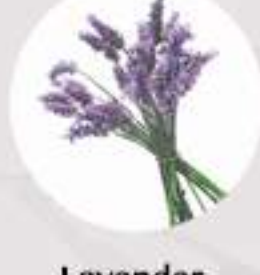
Lavender Essential Oil