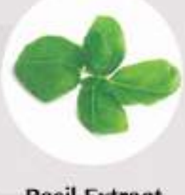
Basil Extract & Essential Oil