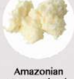
Amazonian Butter Blend