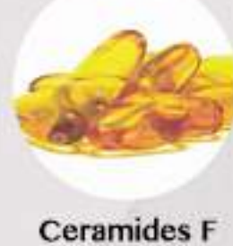
Ceramides F Complex