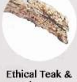
Ethical Teak & Mahogany